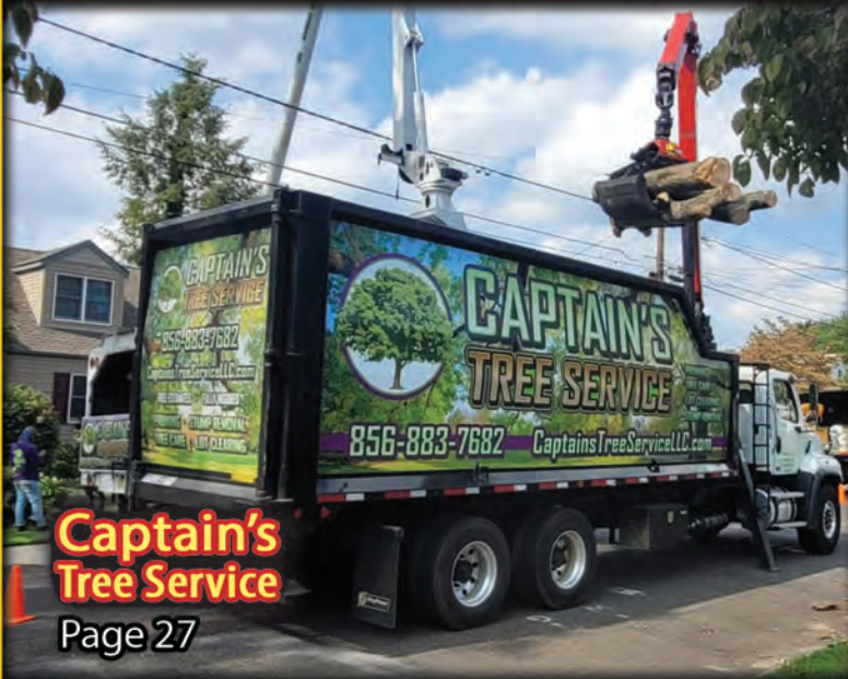
Captain's Tree Service Page 27