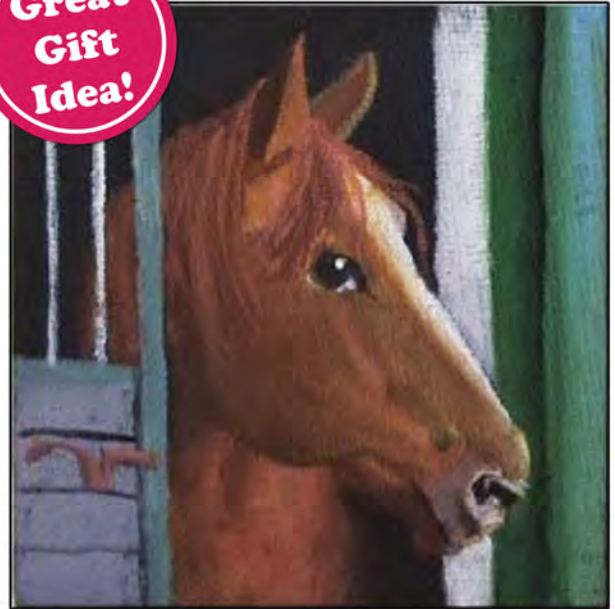
An artful 3" x 3" miniature on canvas