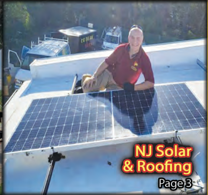
NJ Solar & Roofing Page 3