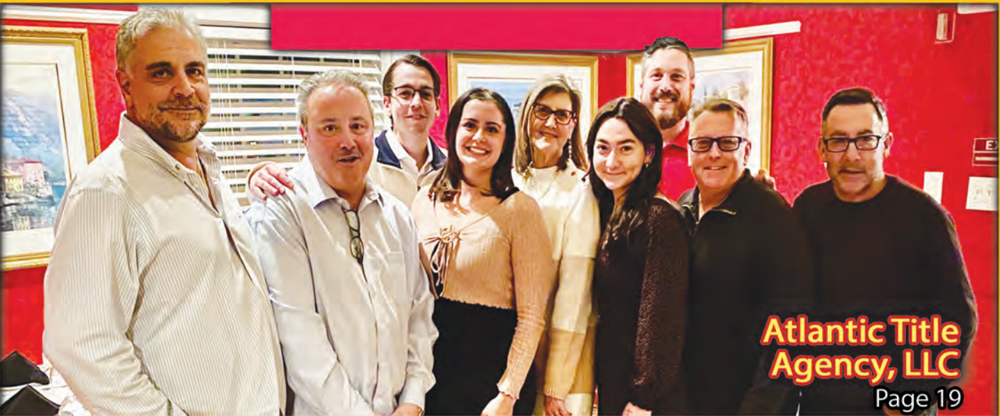
Atlantic Title Agency, LLC Page 19